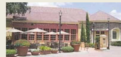
Portobello Italian restaurant.