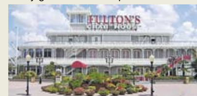
'Walt's home': Fulton's Crab House.

And what a feast we had with huge portions of fabulous food. Having sampled its roasted cloves of garlic spread on fresh crusty bread while perusing the menu, our starters, priced $4.95 to $12.95, included lightly-fried calamari with tomato basil sauce, Mozzarella stuffed rice balls, beef and veal, chicken and spicy pork meatball sliders and an antipasti platter. The pasta mains (work on about $20) are equally spectacular. I love good Italian food and my black linguine with rock shrimp, tomatoes and asparagus was divine. Others in our party were equally impressed with their pasta. My carnivorous elder son devoured the T-bone Fiorentina ($37) with wilted spinach and crispy Trattoria potatoes and a side order of vegetables. We didn't need dessert but they sounded so good we had Biramisu – Portobello's version of Tiramisu with organic porter and mascarpone cream, a rich chocolate cake and a portion of signature dessert, the white chocolate custard with a crispy candy glaze... and six spoons!